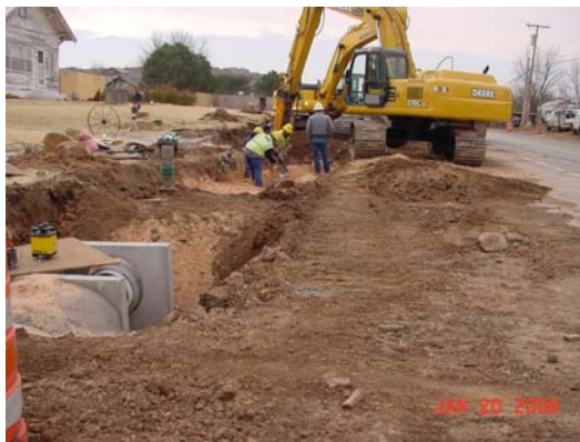
Drainage Pipe Installation Snyder, OK

paving) and K and R Builders (span bridge). The weather and the coordinated efforts of the subcontractors have resulted in the project being well ahead of schedule.