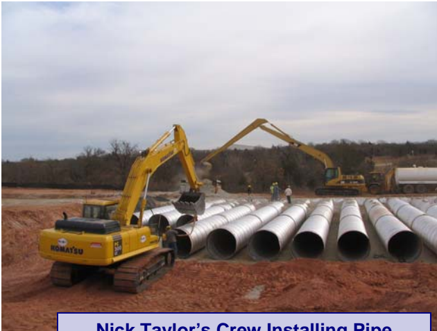
Nick Taylor's Crew Installing Pipe Edmond Wal-Mart

The scope of work for this project involves Wittwer installing approximately 9,500 linear feet of pipe below the Wal-Mart parking lot.