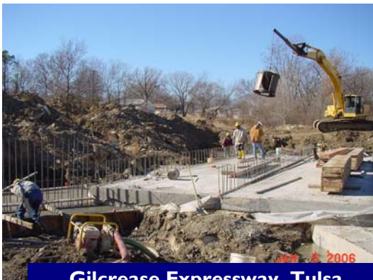
Gilcrease Expressway, Tulsa

The pipe is used to store the storm water from the parking lot. This is in lieu of typical commercial projects that use open detention ponds. According to Con-Tech Piping of Kansas City, (Wittwer's Pipe Supplier) this is the largest underground storage system designed and constructed in the State of Oklahoma. The system also includes Wittwer installing the water filtration system. The filtration system treats the water before flushing onto Public Right of Way.