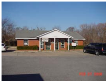
Fort Gibson Office

Address for the Texas office is 4202 Santiago; Austin, TX 78745. Phone number is 512-707-2460