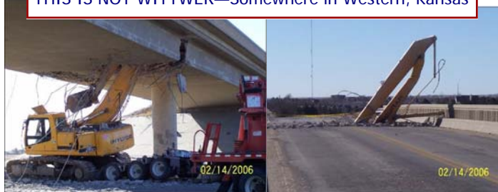
THIS IS NOT WITTWER—Somewhere in Western, Kansas

Hydronic heat helps in Woodrow Wilson Bridge project A project director in charge of the rebuilding of the Woodrow Wilson Bridge in Virginia turned to a Ground Heaters hydronic heating system to allow for a suitable cold-weather concrete curing environment on the bridge. The process isn't cheap, however -- including equipment, insulating blankets, fuel and labor, the cost of using hydronic heat was about $500,000. When complete the bridge will be a 12 lane, twin span structure with a projected cost of $2.4 billion.