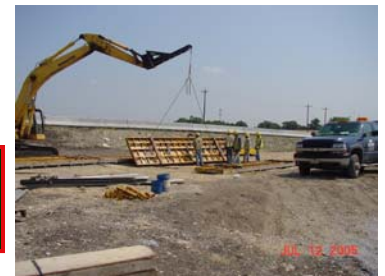
Hwy 121 McKinney TX

Wittwer Construction has a web site: www.wittwerconstruction.com