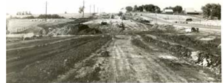
Holton, KS 1960