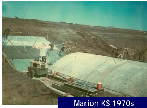
Marion KS 1970s