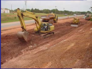
Highway 51 East

If your payroll check must be replaced there will be a $25.00 stop payment charge. Direct Deposit is the best way to go!!