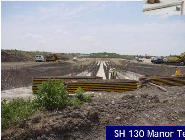
SH 130 Manor Texas

Wittwer, in late 2004 and 2005 started several new projects in Texas including the massive SH130 tollway, which when complete will provide 90 miles of new highway and lessen the congestion on I-35 between Georgetown and San Antonio.