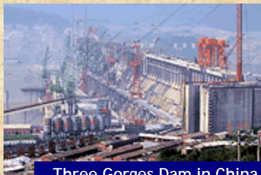
Three Gorges Dam in China