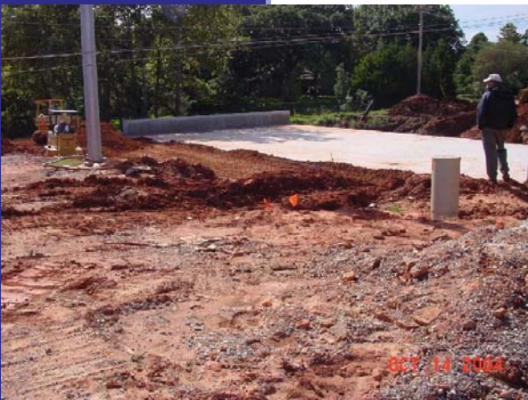
150th and Western OKC Completed in 2005

Noe will also be scheduling an OSHA 10 Hour in Spanish for Spanish speaking employees living in the OKC area. He will be scheduling and announcing this class.