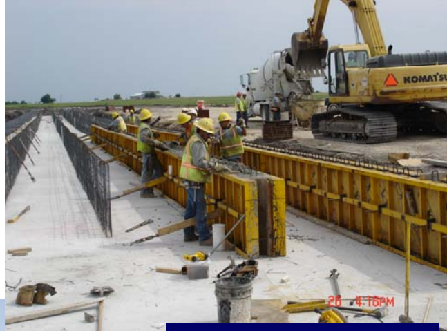
I10 San Antonio Texas