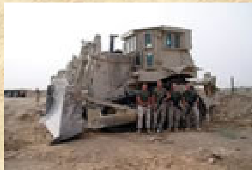
U.S Soldiers Building in Iraq