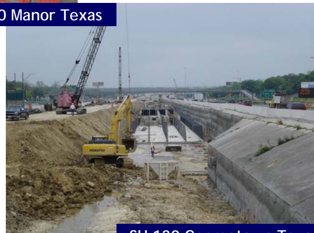
SH 130 Georgetown Texas